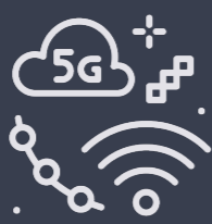
Communication and Networking